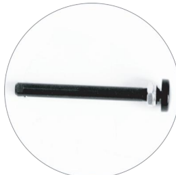
Quick Release Axle