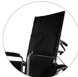
Reclining High Back