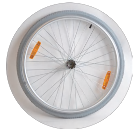
Spoke Rear Wheel (Pneumatic tire/PU tire)