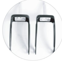
Front Fork (plastic/steel/aluminum)