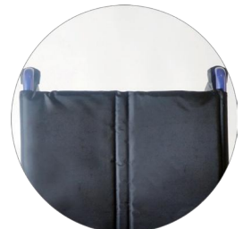
Tannin Cloth Backrest