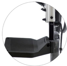
Angle Adjustable Footplate