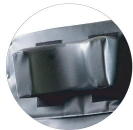
Head Rest Pillow