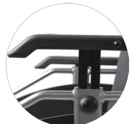
Height Adjustable Armrest