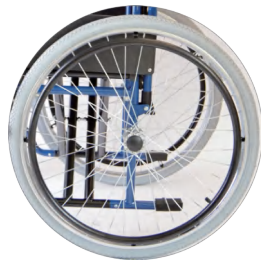
Handrim (Plastic/ Steel/ Aluminum)