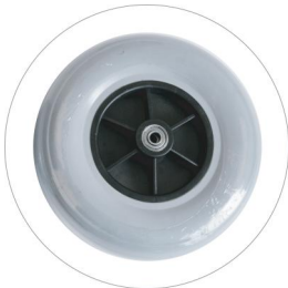
Front Wheel (PVC tire, RUBBER, PU tire)