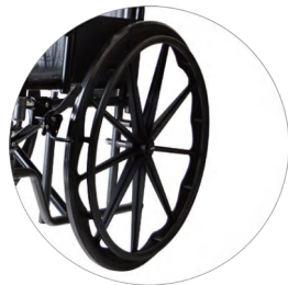
8/9 MAG Rear Wheel