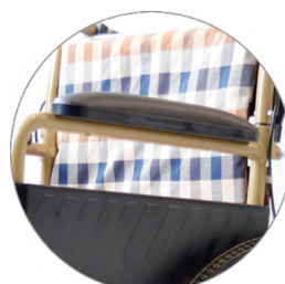
Full Length Armrest